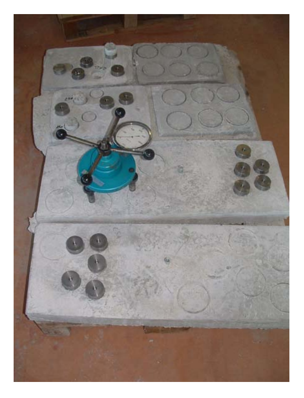
Fig. 6 - Bond strength test by pull-out (UNI EN 1542).