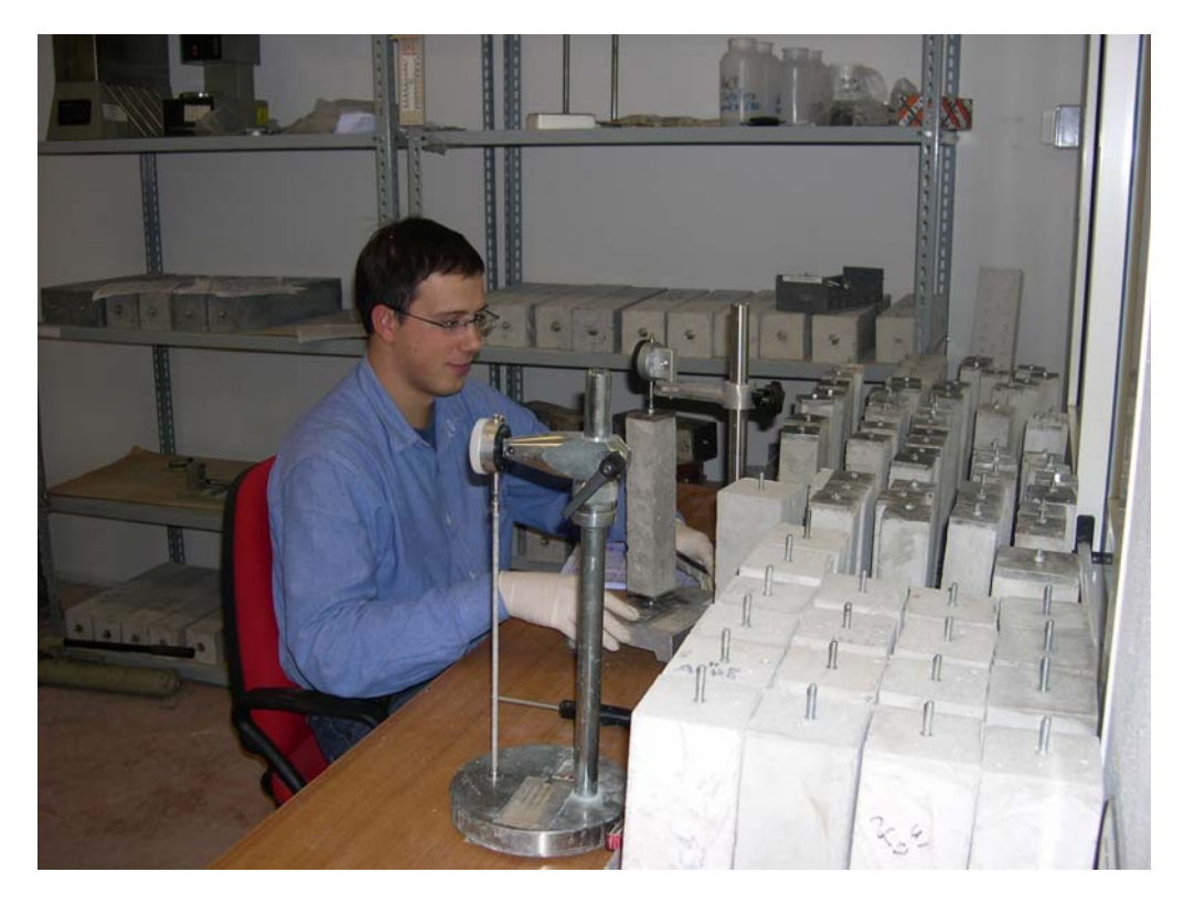
Fig. 10 - Restrained expansion measurement (UNI 8147).