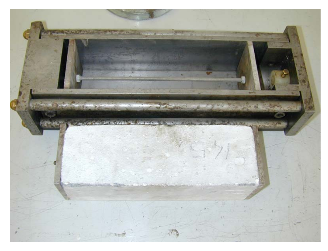
Fig. 9 - Restrained expansion specimen (UNI 8147).