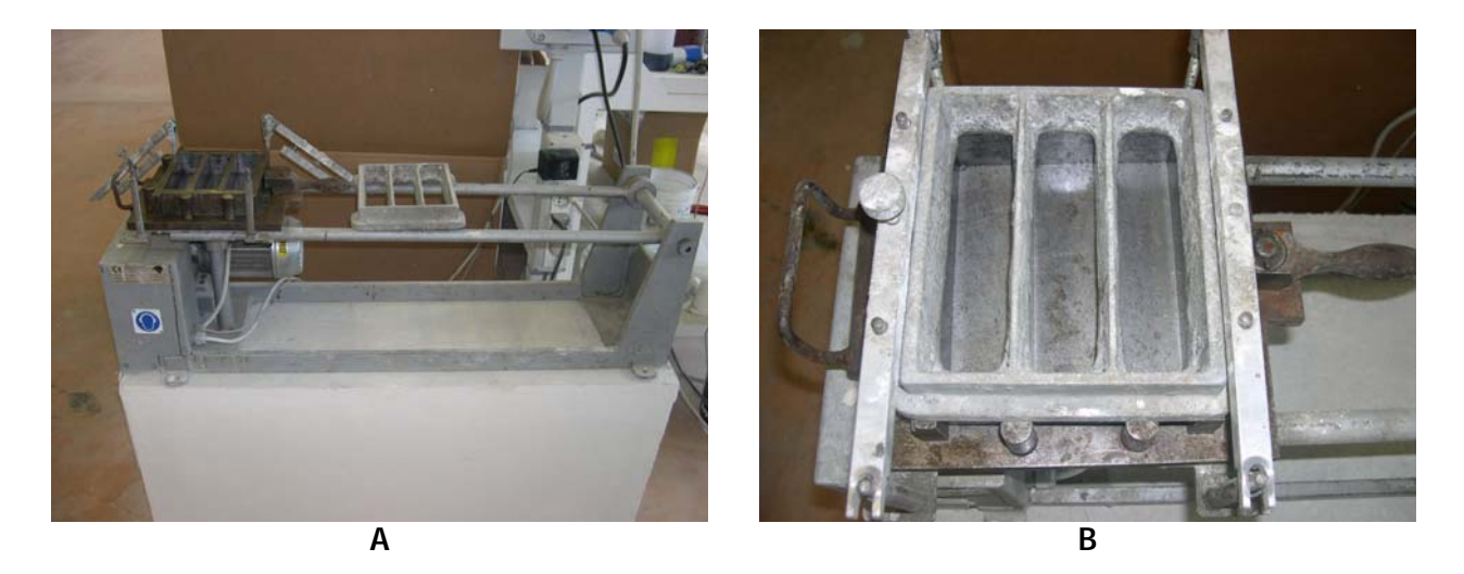
Fig. 12 A-B - Casting apparatus for mortar specimens(UNI EN 196/1).