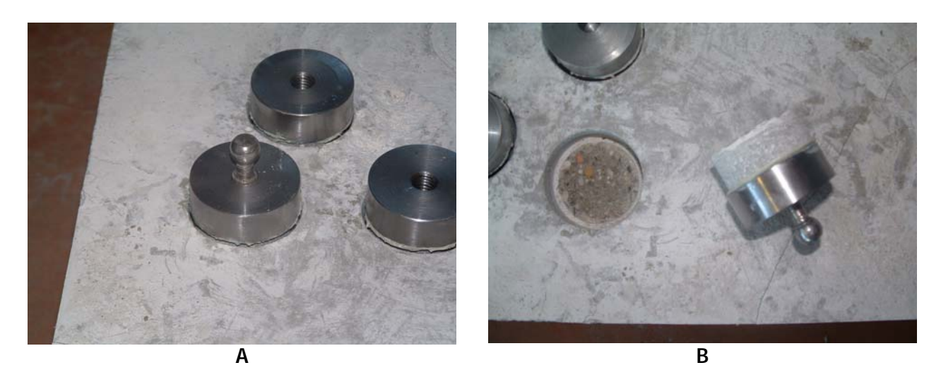
Fig. 8 A-B - Specimens for pull-off test (UNI EN 1542).