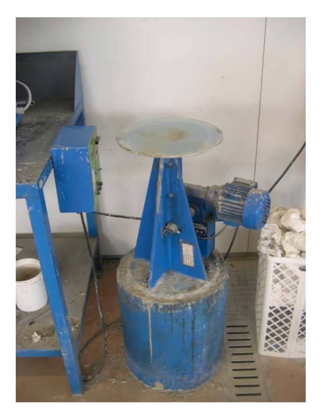
Fig. 2 - Mortar flow table (UNI 7044).