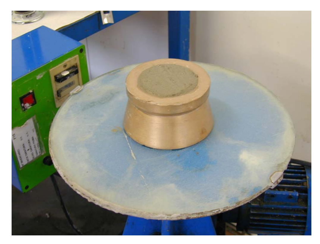
Fig. 3 - Mortar come for flow test (UNI 7044).