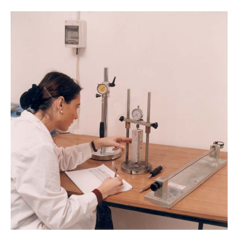
Fig. 11 - Shrinkage measurement (UNI 6687).