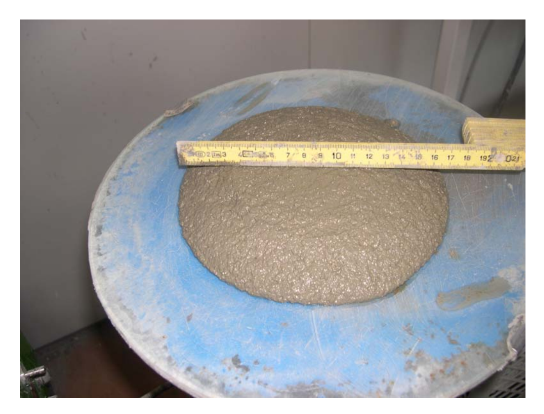
Fig. 4 A - Flow table measurement for tixotropic mortar.