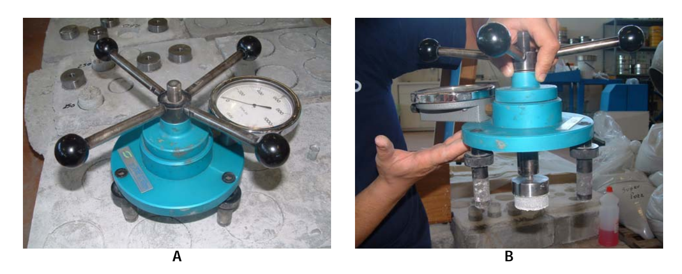
Fig. 7 A-B - Pull-Off apparatus for bond strength measurement (UNI EN 1542).