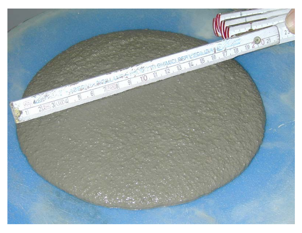
Fig. 4 B - Flow table measurement for flowing mortar.