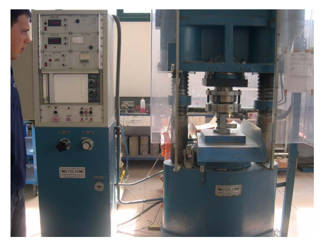
Fig. 13 - Casting apparatus for mortar specimens (UNI EN 196/1).