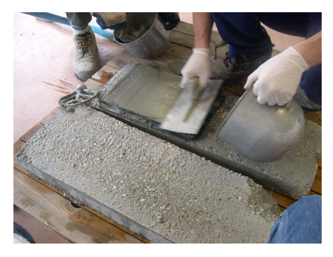
Fig. 5 - Concrete substrate for bond strength test (UNI EN 1766).